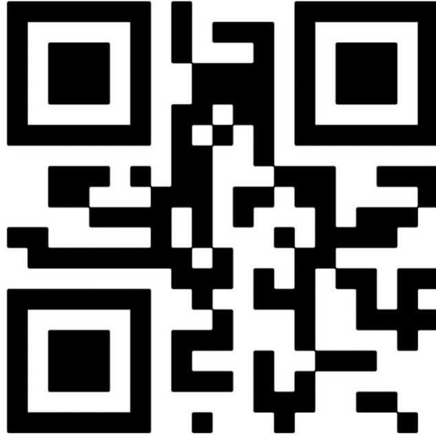
Configuration QR code