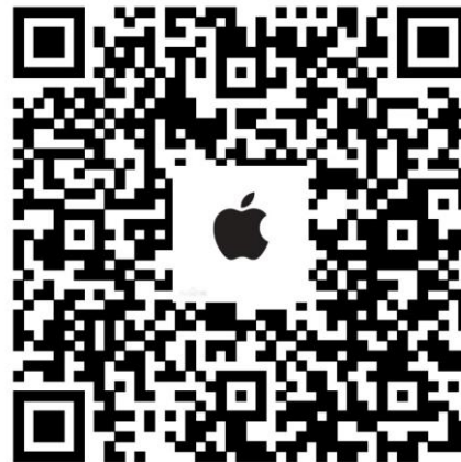
Apple download locations