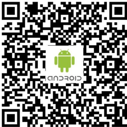
Android download locations